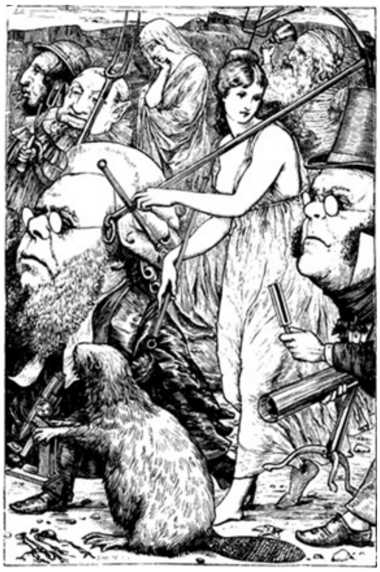
"To pursue it with forks and hope"