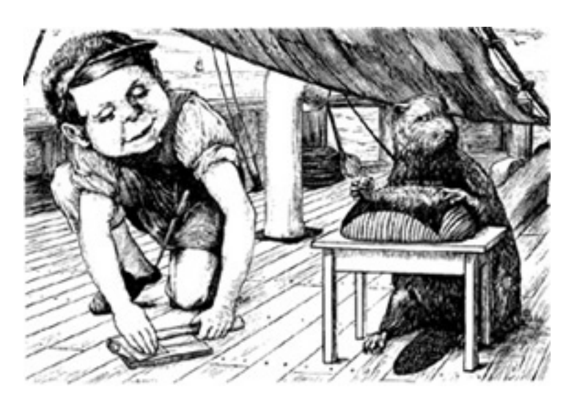
The Beaver kept looking the opposite way

The Beaver's best course was, no doubt, to procure A second–hand dagger–proof coat— So the Baker advised it—and next, to insure Its life in some Office of note: