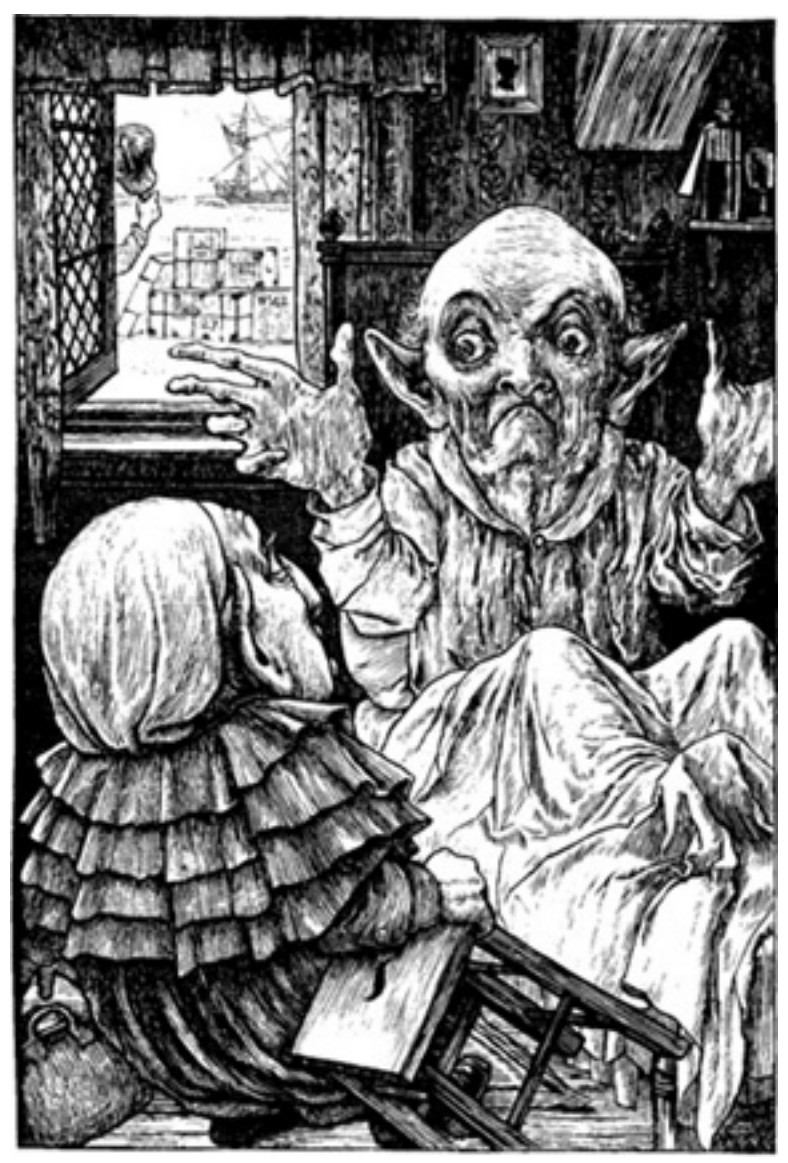
"But oh, beamish nephew, beware of the day"