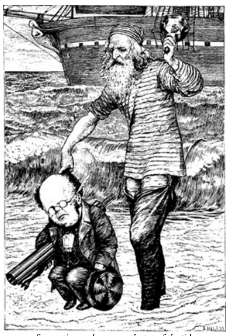
Supporting each man on the top of the tide