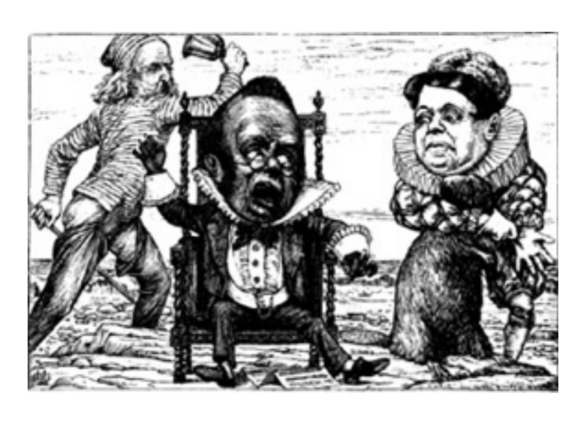
... so great was his fright that his waistcoat turned white