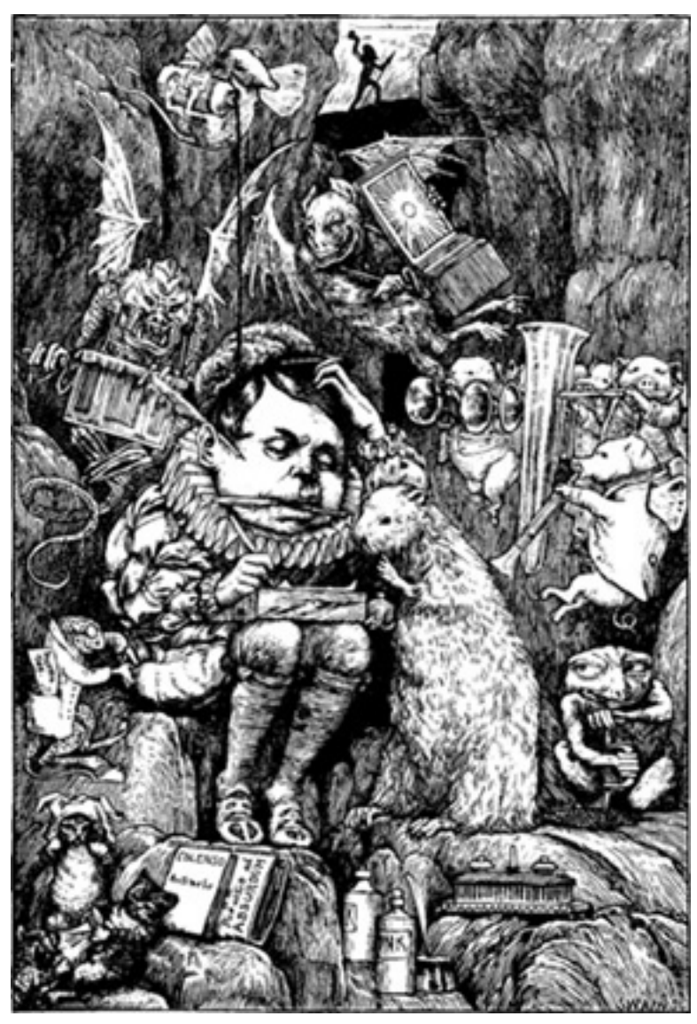
The Beaver brought paper, portfolio, pens