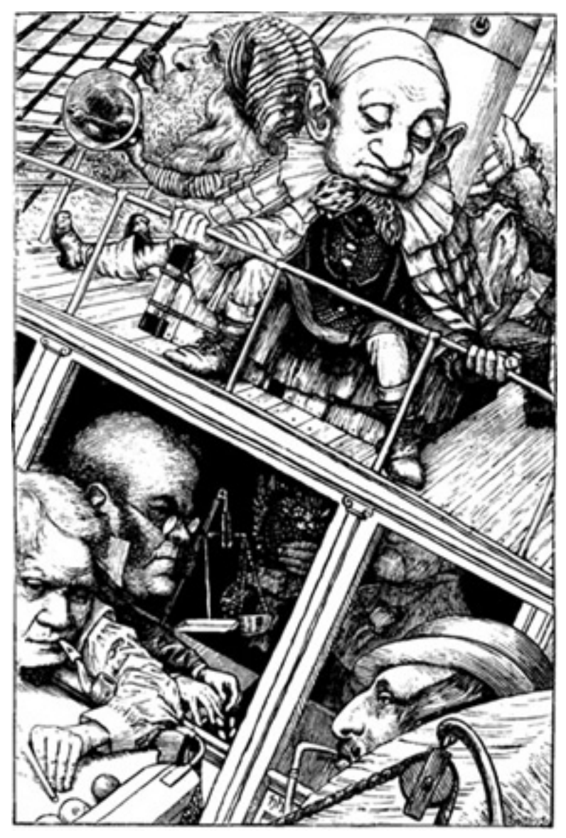
He had wholly forgotten his name