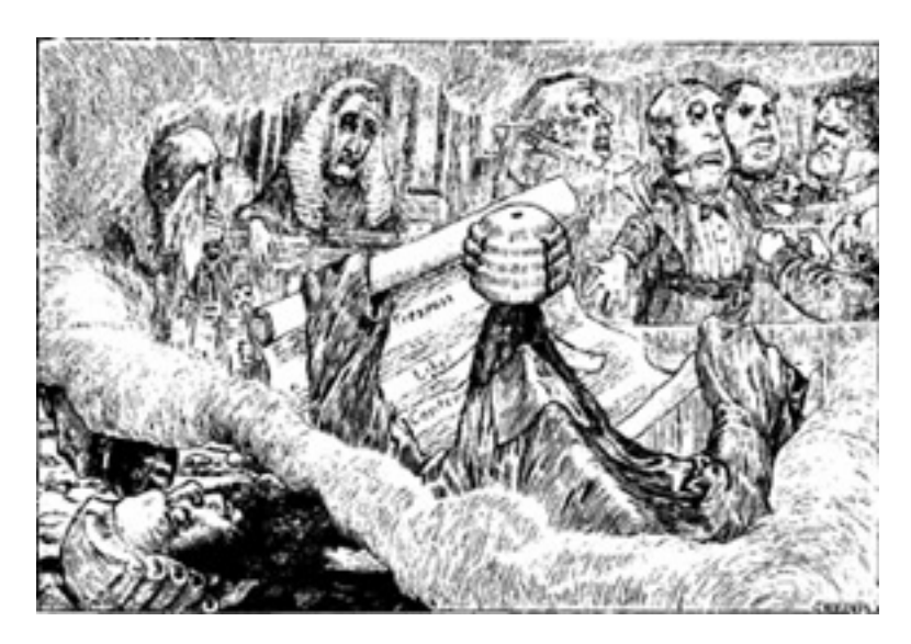
"You must know——" said the Judge: but the Snark exclaimed, "Fudge!"

"You must know——" said the Judge: but the Snark exclaimed "Fudge!"