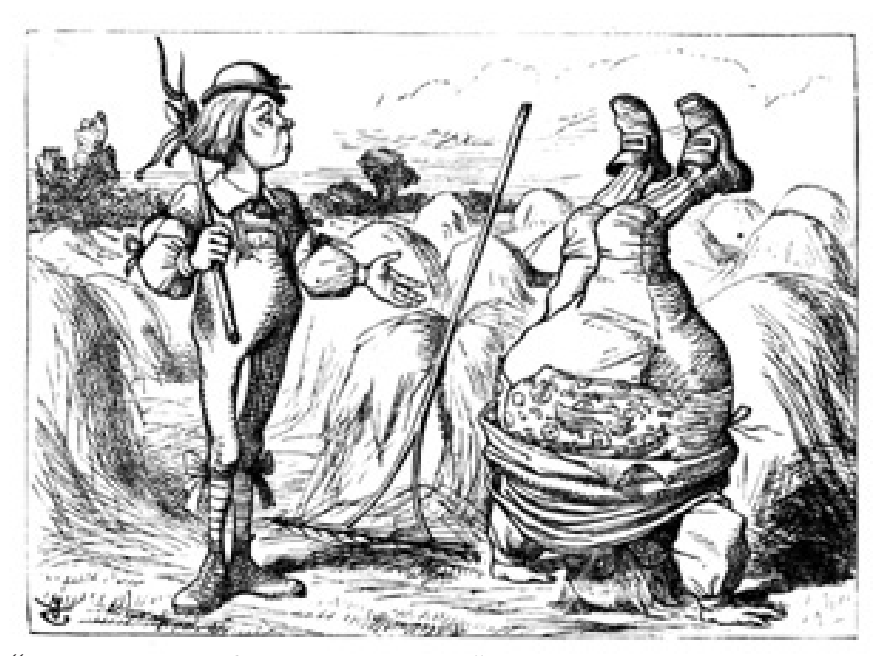
"You are old, father William," the young man said, "And your hair has become very white; And yet you incessantly stand on your head— Do you think, at your age, it is right?"

"In my youth," father William replied to his son, "I feared it might injure the brain; But, now that I'm perfectly sure I have none, Why, I do it again and again."