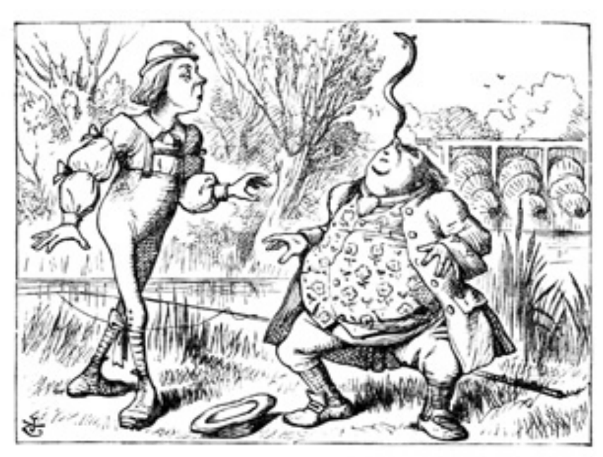
"You are old," said the youth, "one would hardly suppose That your eye was as steady as ever; Yet you balanced an eel on the end of your nose— What made you so awfully clever?"

"I have answered three questions, and that is enough," Said his father; "don't give yourself airs! Do you think I can listen all day to such stuff? Be off, or I'll kick you down stairs!"