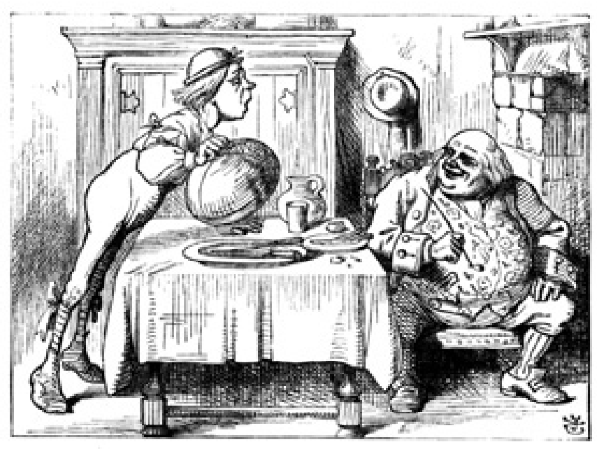
"You are old," said the youth, "and your jaws are too weak For anything tougher than suet;

Yet you finished the goose, with the bones and the beak— Pray, how did you manage to do it?"