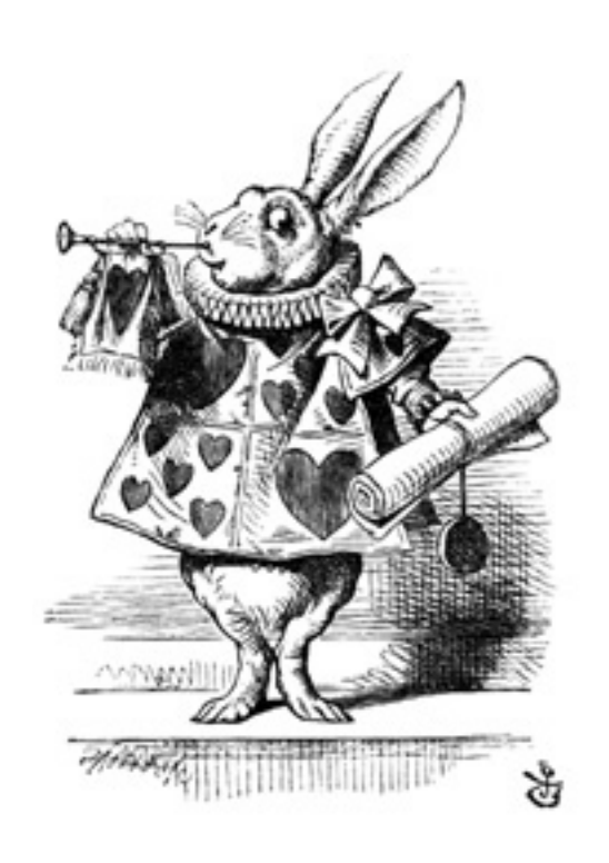
"The Queen of Hearts, she made some tarts, All on a summer day: The Knave of Hearts, he stole those tarts, And took them quite away!"

"Consider your verdict," the King said to the jury.