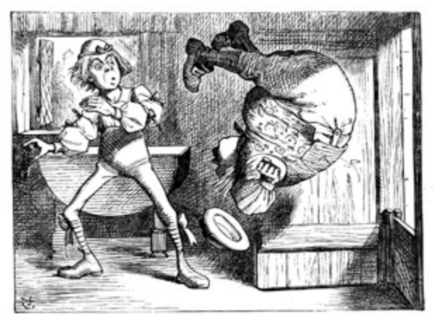
"You are old," said the youth, "as I mentioned before, And have grown most uncommonly fat; Yet you turned a back-somersault in at the door— Pray, what is the reason of that?"

"In my youth," said the sage, as he shook his grey locks, "I kept all my limbs very supple By the use of this ointment—one shilling the box— Allow me to sell you a couple?"