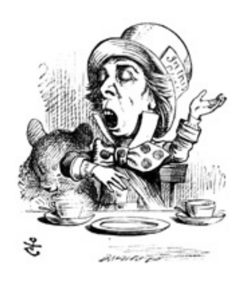
'Twinkle, twinkle, little bat! How I wonder what you're at!'