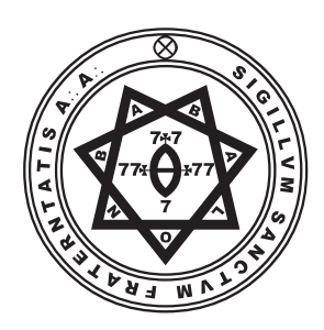
A : A : . Publication in Class B.