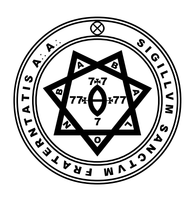
A :: A :: Publication in Class A